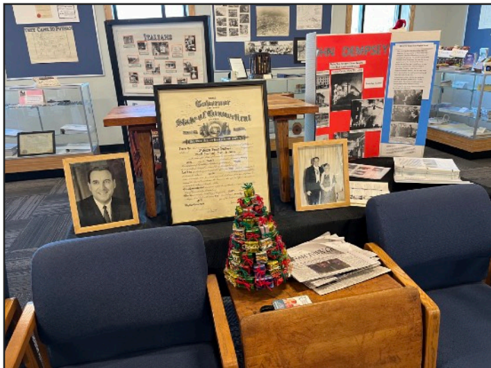
Display of John N. Dempsey artifacts and documents at the Aspinock Historical Society Museum during the winter months.