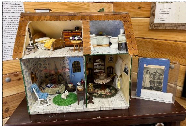
The newly refurbished doll house inspired by Gertrude Warner's early children's book, "House of Delights."